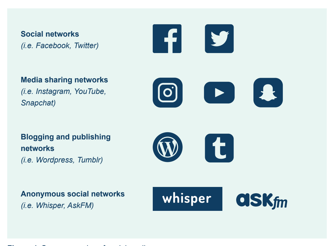
Figure 4. Some examples of social media

It can also be useful to identify different categories of social media, and discuss how they work, what the audience is, and why people use them. Social media includes: